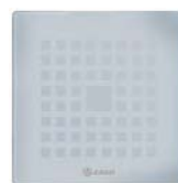
Glory - 1