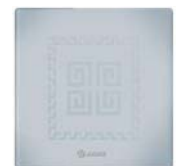
Glory - 6