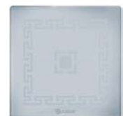
Glory - 3