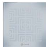
Glory - 4