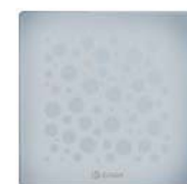
Glory - 2