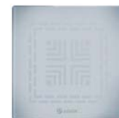
Glory - 5