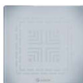
Ice - 5