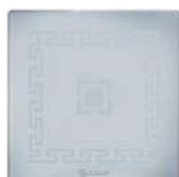
Ice - 3