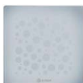
Ice - 2