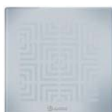
Ice - 4