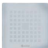
Ice - 1