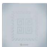
Ice - 6